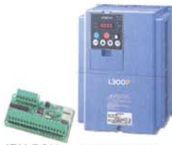
IPU-PSM L300P Series

A powerful solution for demanding pumping applications