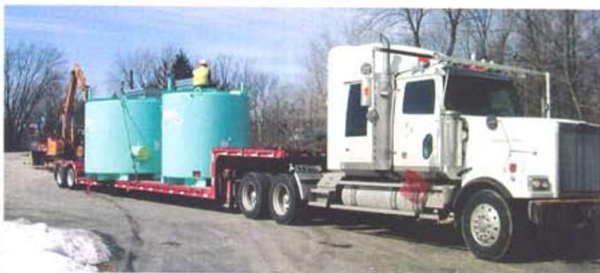
Two pressure reducing stations arriving at the job site in Mundelein, Ill., on a tractor trailer

The design scope included the addition of five interconnection points using five separate pressure reducing stations.