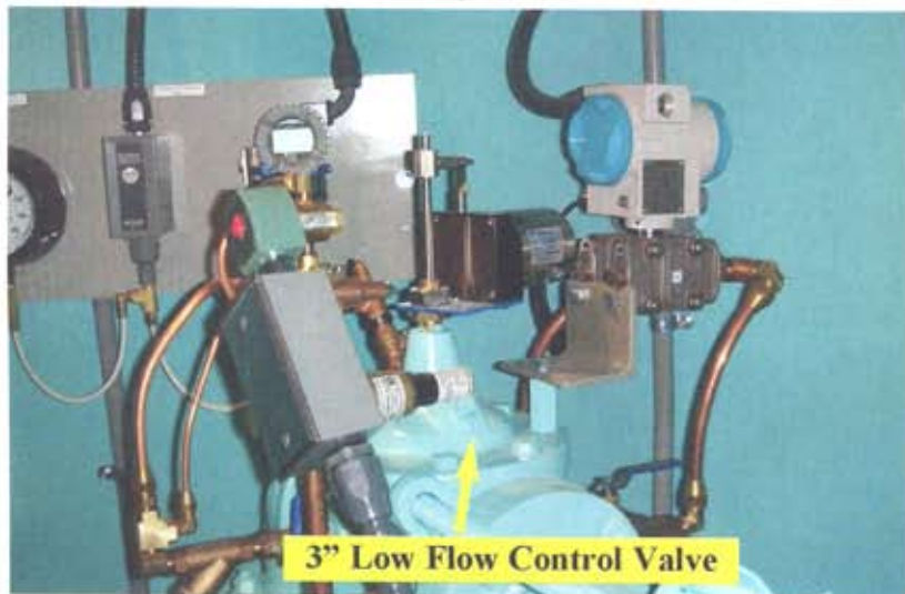
3-in low flow control valve