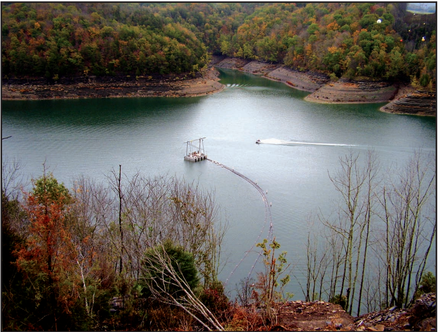
Lake Cumberland, Kentucky, showing the much lowered lake level. The floating pump barge is seen tethered with water lines and electrical lines from shore to the barge.

The pumps were set onto a barge and the pump controls were in an EFI pre-fabricated, factory-built electrical apparatus building. This building was built at the EFI plant in Centralia, Illinois and shipped to the jobsite complete, to be placed on a concrete foundation on the bank of the reservoir.