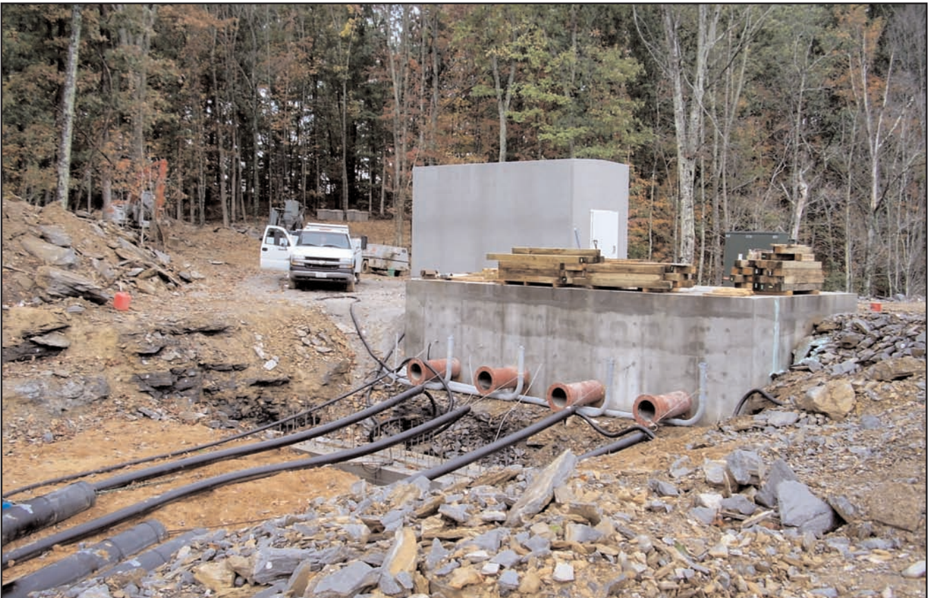
Packaged control and starter building setting behind the concrete valve vault and structure.