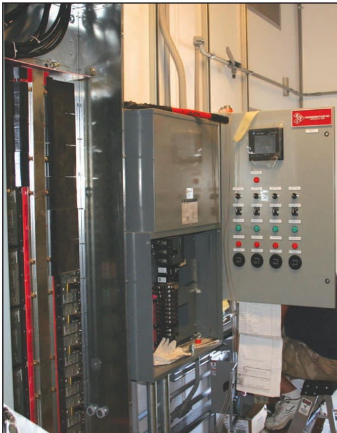
Pump controls and distribution panel being installed.