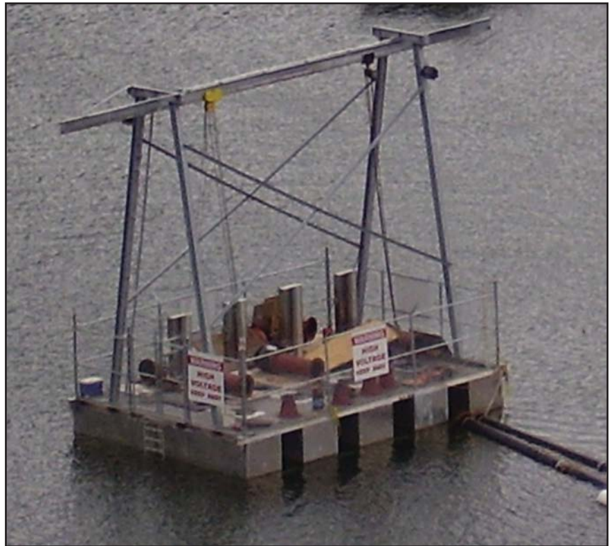
Floating pump barge on Lake Cumberland in Kentucky.