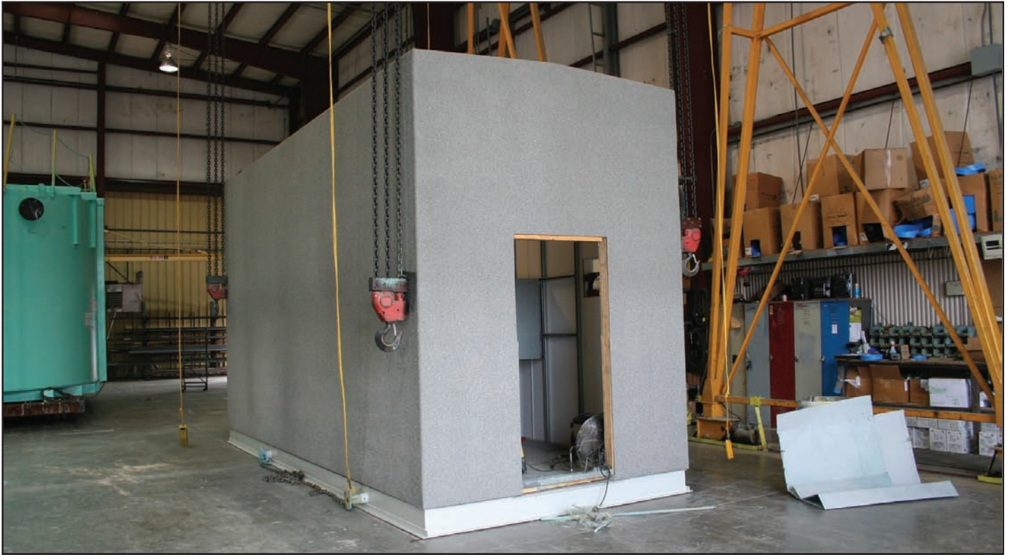
EFI built building shell ready for installation of the power distribution panel, automatic transfer switch and the four variable frequency motor drives.