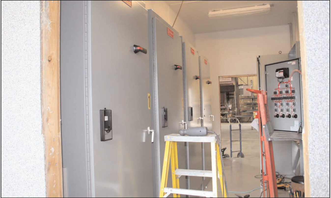
Pump controls and power distribution equipment nearing completion.